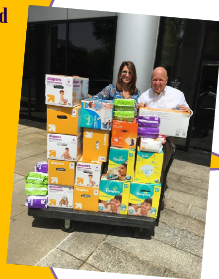
Enterprise delivers record number of diapers!