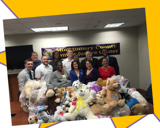
BAR-T delivers stuffed animals to the FJC and FJC Foundation.

Hungerford's Tavern Chapter Daughters of the American Revolution