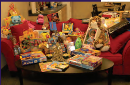
The display of holiday gifts and toys donated by the Bar Association of Montgomery County.

This half day conference will take place at the Takoma Park Campus of Montgomery College in the (Continued to page 6)