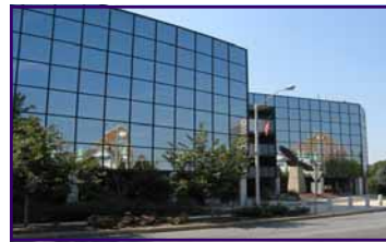
The Montgomery County Family Justice Center is centrally located in the heart of Rockville, Maryland.

County and state agency leaders and the public to discuss, advocate for, and implement reforms to better help victims, to make progress in breaking the cycle of domestic violence, and to advocate for laws that better protect victims and that improve the ability to arrest those who per-