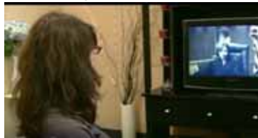
Video conferencing at FJC provides a safe link to Judges.

to provide petitioners a safe and secure environment in which to obtain their orders. It was also deemed the most efficient method to provide services to petitioners. Prior to the implementation of this